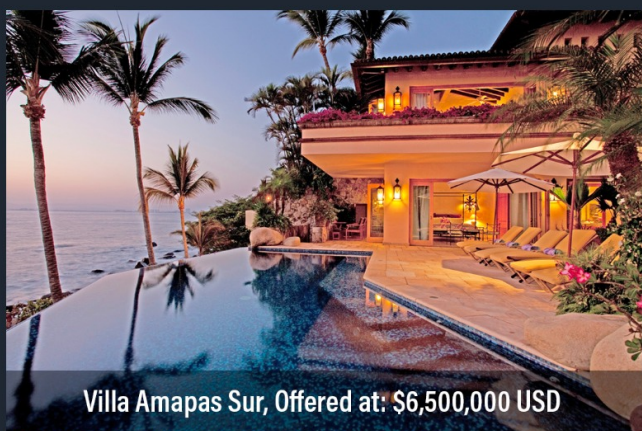
Villa Amapas Sur, Offered at: $6,500,000 USD