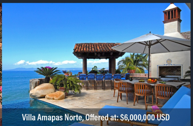
Villa Amapas Norte, Offered at: $6,000,000 USD